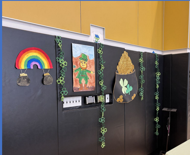
St. Patrick's Dance