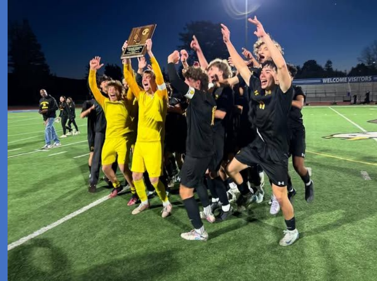
Boys Soccer = NorCal Champion