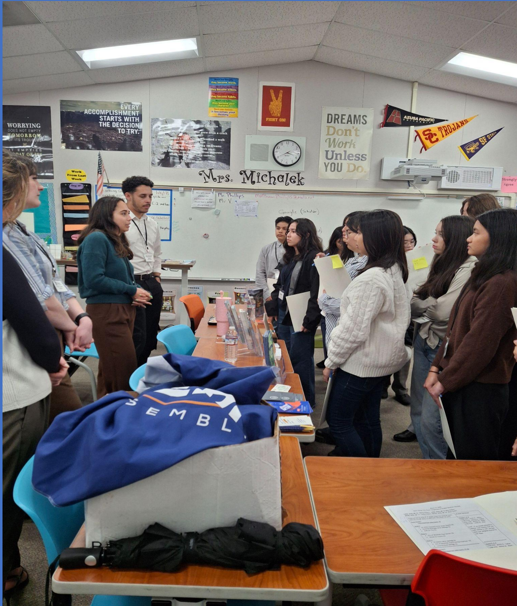
AVID Job Fair