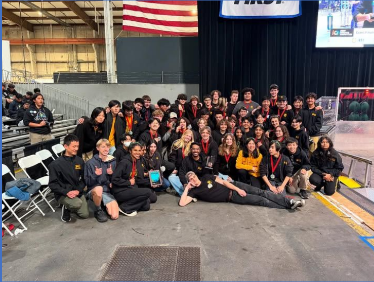
FRC 971 @ Ventura Regional