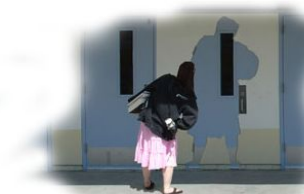
Students finding THEIR door