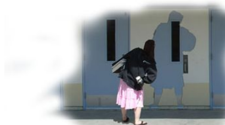
Students finding THEIR door