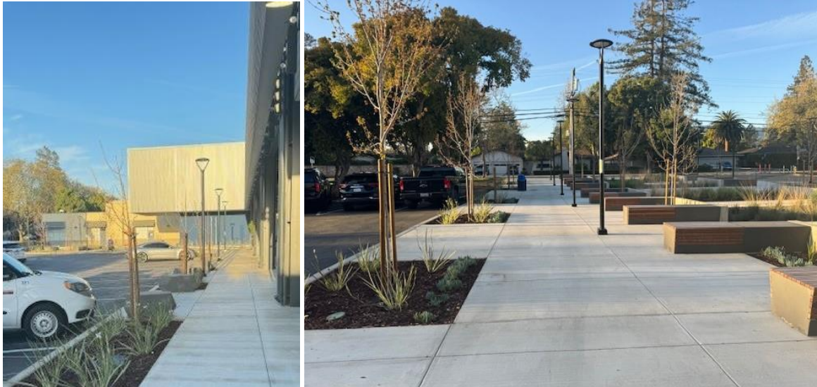
From L to R: Four Princeton Sentry Ginkgo replacement trees and 13 Redpointe Maple replacement trees.

adequately serve as replacement trees for this protected tree and the five non-protected trees. The 17 replacement trees were planted south of the Student Services Building. The four northernmost replacement trees are of the species Ginkgo Biloba 'Princeton Sentry' (Princeton Sentry Ginkgo), and the remaining 13 trees are of the species Acer Rubrum 'Redpointe' (Redpointe Maple). Photos of the replacement trees are included below.