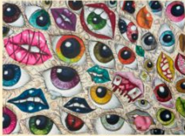
Corinee Beavers Drawing I