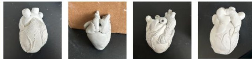
Paulina Vvedenskaya AP Studio Art 3D