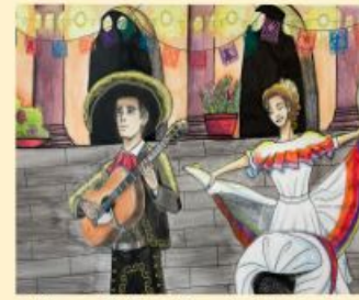
Diego Palma Drawing II