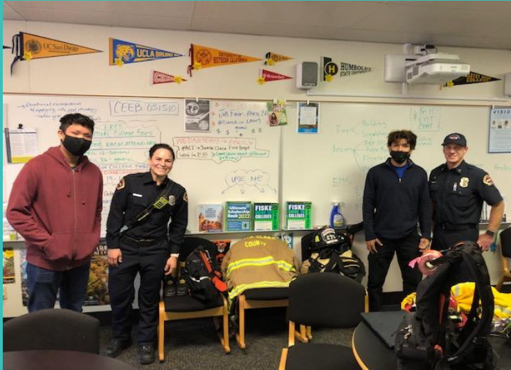
Santa Clara County Fire, Career Presentation

Guiding Principle: We are committed to supporting all students prepare for the path of their choice after high school!