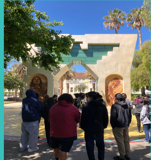
CCEIS Students on SJSU campus visit